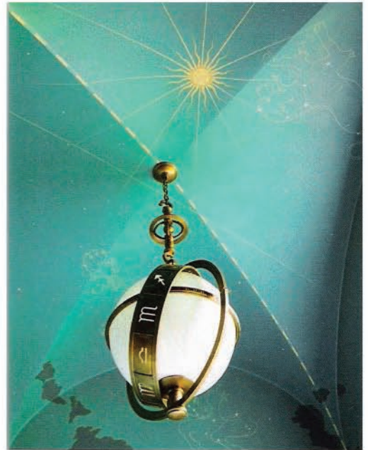
The blue lacquered bar and quartzite countertop; the bar's ceiling, painted by Raymond Goins, an homage to the one in Grand Central Terminal, with an astrological lantern from Visual Comfort.